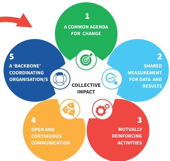
Collective impact approach