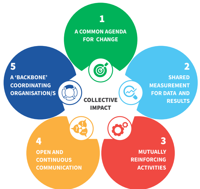
Collective impact approach