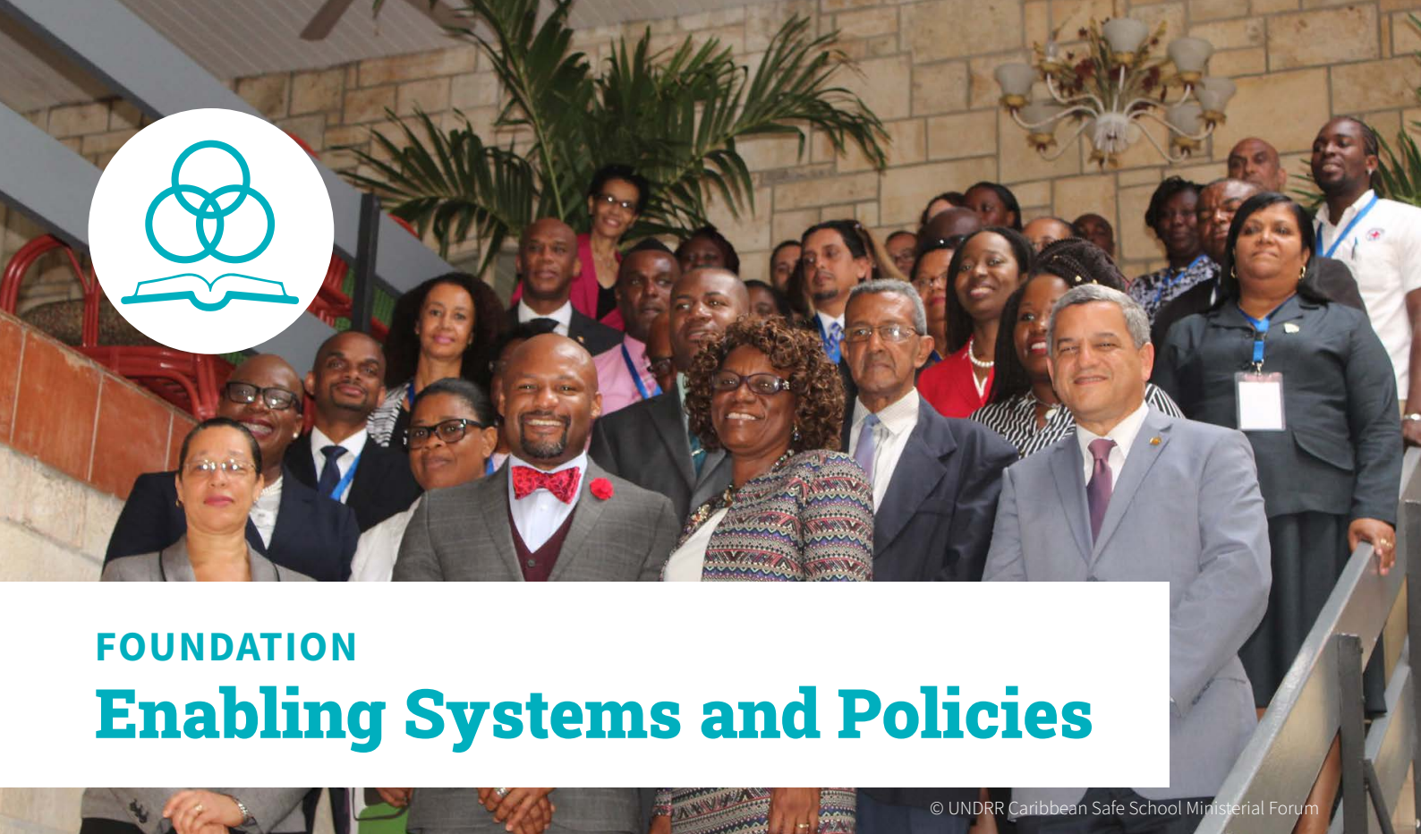
© UNDRR Caribbean Safe School Ministerial Forum