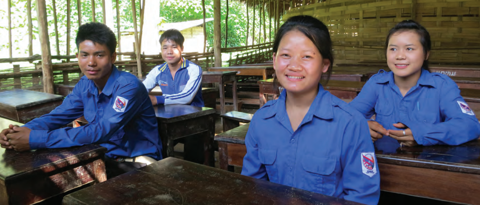
Students at a Laos school take classes in buildings constructed by development actors and the local community.