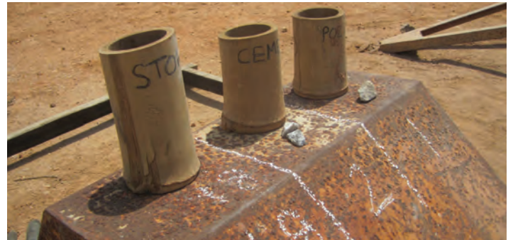
A community-based approach enhances community skills and capacity in hazard-resistant construction. What communities learn during the construction of a safe school can be applied to their own houses, building a culture of safety.