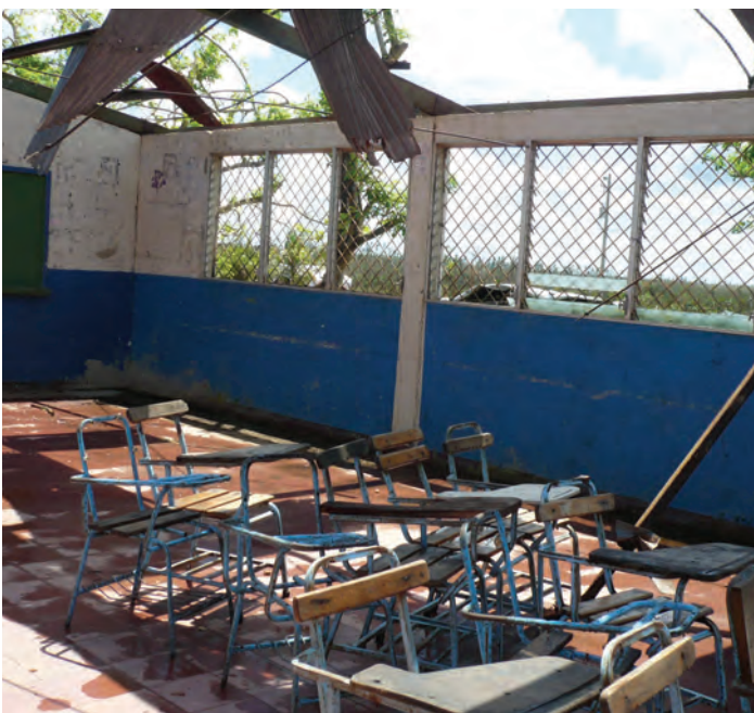
In 2007, Hurricane Felix damaged learning facilities in Nicaragua. Such damages destroy development gains and undermine students' access to education.

Every learning facility should be maintained to protect education sector investments from known and anticipated hazards.