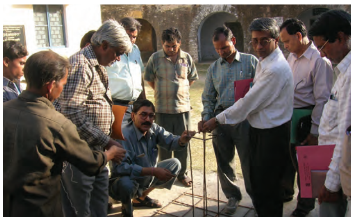
Community-based safe school construction provides an important training grounds for new skills. Projects should support training for skilled craftsmen and women who need to learn hazard-resistant construction techniques.