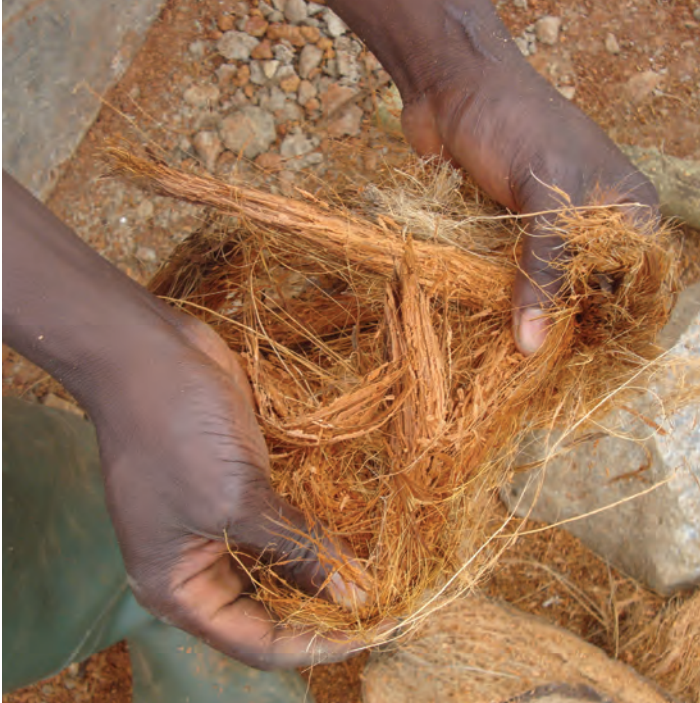
A community-based approach ensures materials and construction techniques are appropriate for the local context.