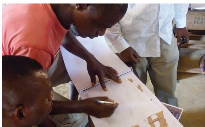
In a community-based approach, local communities work with technically qualified individuals to design schools that are safe and culturally appropriate.