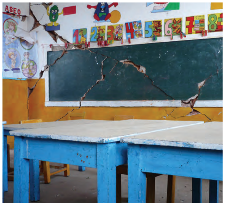
In 2007, the Picaso earthquake in Peru rendered this primary school classroom unsafe for use. Heavily damaged learning facilities must often be torn down. Moderate changes to design and construction can reduce the likelihood of heavy damage and ensure children have access to education, even after disaster strikes.