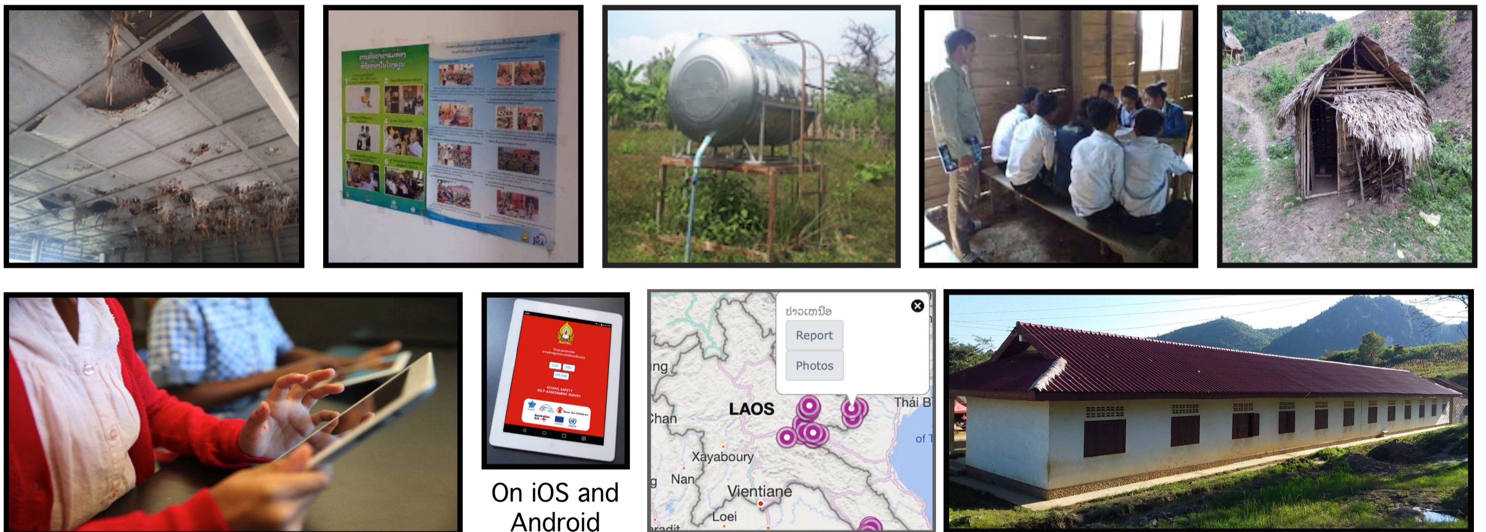
On iOS and Android

School Safety Assessment Report Location, school name and ID, type, uses, enrollment. Hazards, impacts and CSSF Pillar 1, 2 and 3 details. Rating, ranking and recommendations.