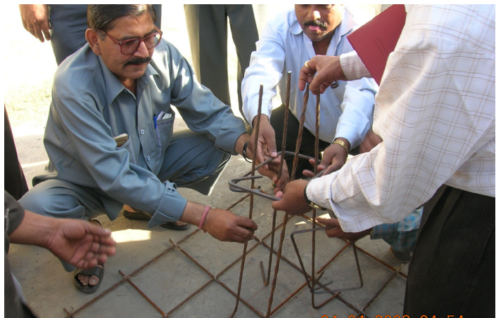
Figure 2. Before masons could build earthquake-resistant schools, they participated in training that included hands on activities where masons built their own earthquake-resistant models.